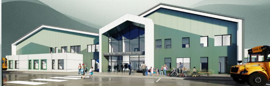
THE THREE SISTERS CENTRE